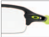
Matte Black 801502