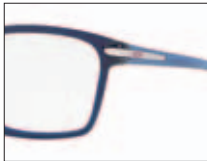
Polished Ice Blue 801002