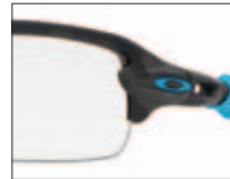
Matte Black Camo 801505