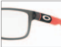
Satin Grey Smoke 800702