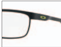
Satin Black 300204