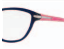
Ice Blue 800804