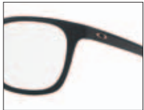
Satin Black 800401