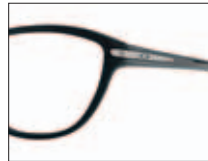
Polished Black 800805