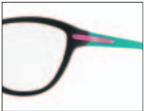
Satin Black 800801