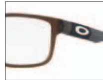
Satin Brown Smoke 800705