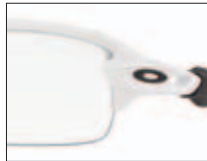
Polished White 801503