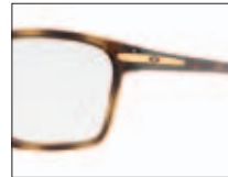
Polished Brown Tortoise 801006