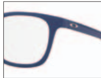
Matte Denim 800403