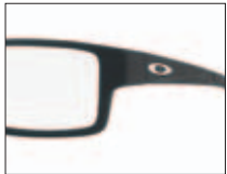
Satin Black 800301