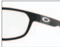
Polished Black 801105