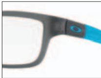
Satin Grey Smoke 800502