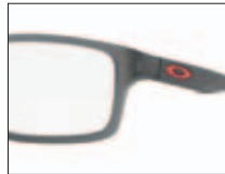
Satin Grey Smoke 800203