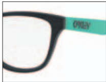
Satin Black 800901