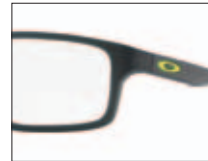
Satin Olive 800211