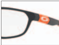
Satin Black 801104