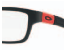
Polished Black 800503