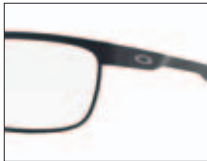
Matte Midnight 300203