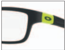
Satin Black 800501