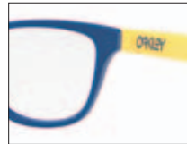
Polished Navy Blue 800904