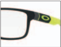
Satin Black 800701