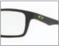
Satin Black 800101