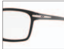
Polished Black 801005