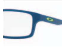
Satin Navy 800204