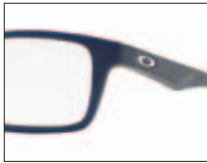
Polished Blue Ice 800104