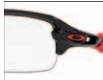
Polished Black 801504