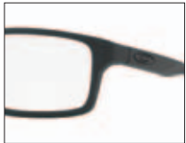
Satin Black 800201