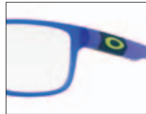
Matte Sea Glass 800704