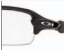
Matte Black 801501