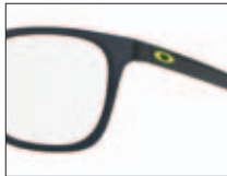
Matte Black Ink 800402