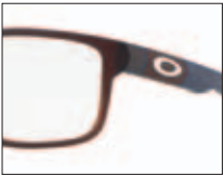
Satin Dark Amber 800706