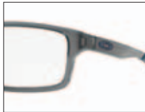
Polished Grey Smoke 800202