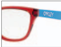
Translucent Red 800902