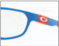
Polished Blue 801101