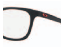
Matte Black 800404