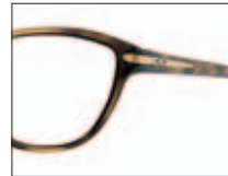
Polished Brown Tortoise 800806