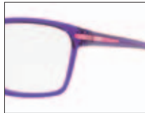
Polished Purple 801003