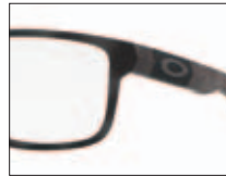
Satin Black Camo 800709