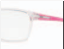
Polished Clear 801001