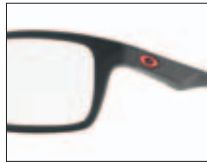
Polished Black Ink 800105