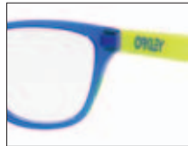
Polished Sea Glass 800903