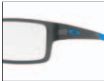
Satin Grey Smoke 800303