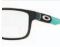
Black Ink 800703